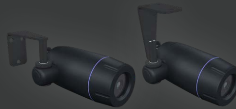
WALL/CEILING (MULTI) BRACKET